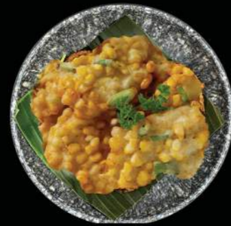
BAKWAN JAGUNG (CORN FRITTERS) 8.00 (3PCS) / 3.00 (1PC)