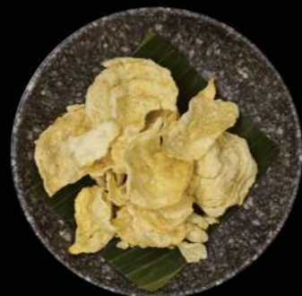
A PORTION OF MELINJO CRACKERS 2.70