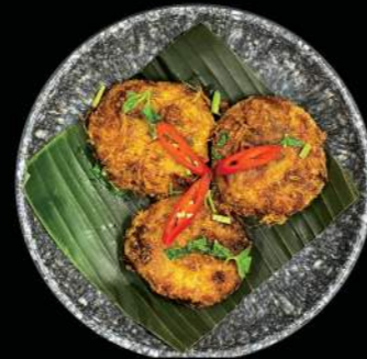
PERKEDEL (POTATO CAKES) 7.50 (3PCS) / 2.80 (1PC)