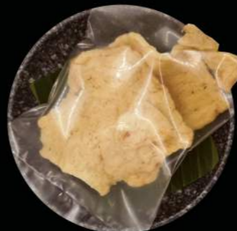
PRAWN CRACKERS 2.70