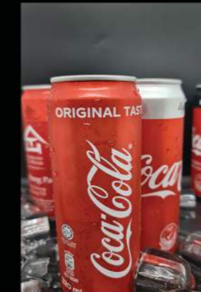
CAN DRINKS 3.00