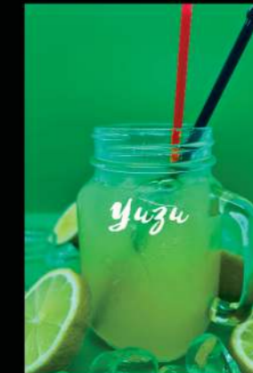
FIZZY YUZU DRINK 4.50