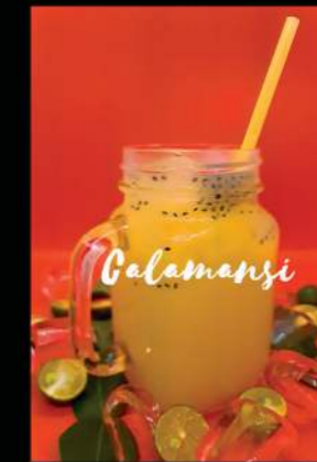
ICE CALAMANSI 4.50