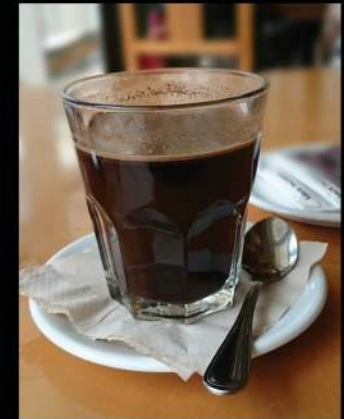
KOPI TUBRUK 4.50