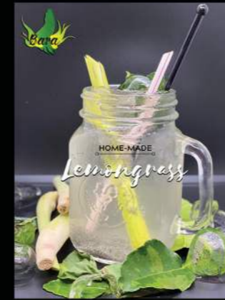
HOME-MADE LEMONGRASS DRINK 4.50