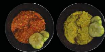
SMALL BOWL OF BARA SAMBAL 2.70