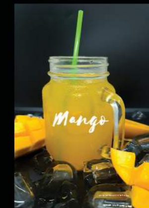
FIZZY MANGO DRINK 4.50