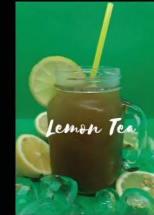
ICE LEMON TEA 4.50