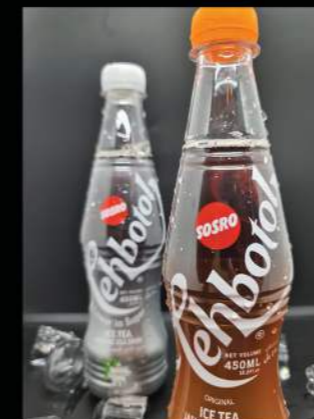
TEH BOTOL 3.50