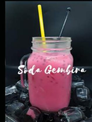
HAPPY SODA 4.50