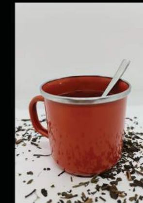
TEH POCI (FREE REFILL) 2.50