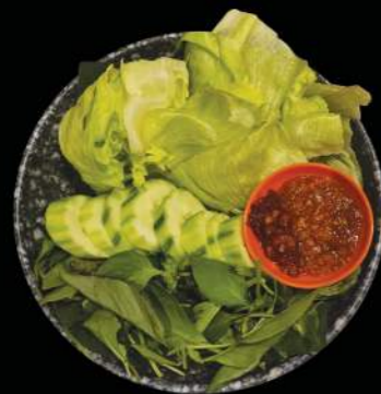
LALAPAN (RAW VEGETABLES SALAD) 4.50