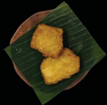
FRIED TOFU AND TEMPEH 3.00